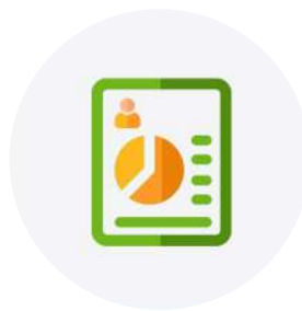
Reporting & Analytics